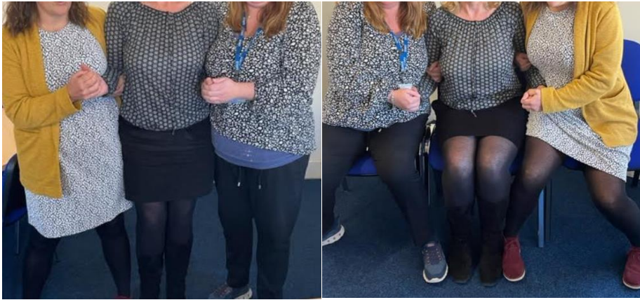
Reference: Seated rest position 7