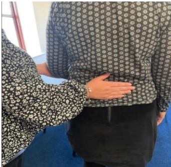
Reference: Guiding 3