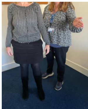
Reference: Prompting 2