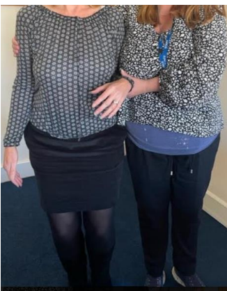
Reference: Escort 4