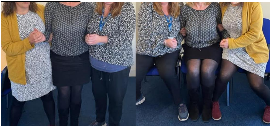
Reference: Seated rest position 7