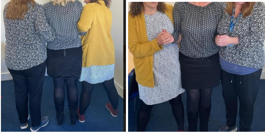
Reference: Double cup hold 5