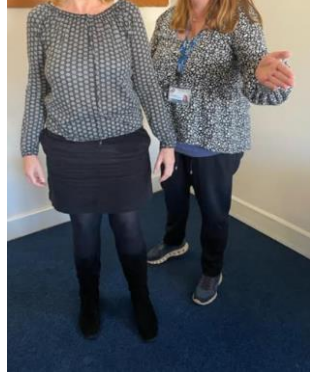
Reference: Prompting 2