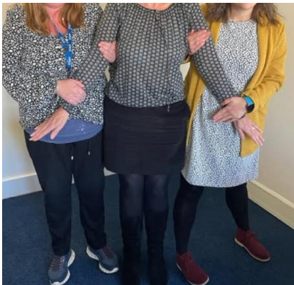
Reference: Straight arm immobilisation 6