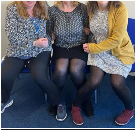
Reference: Seated kicking position 8